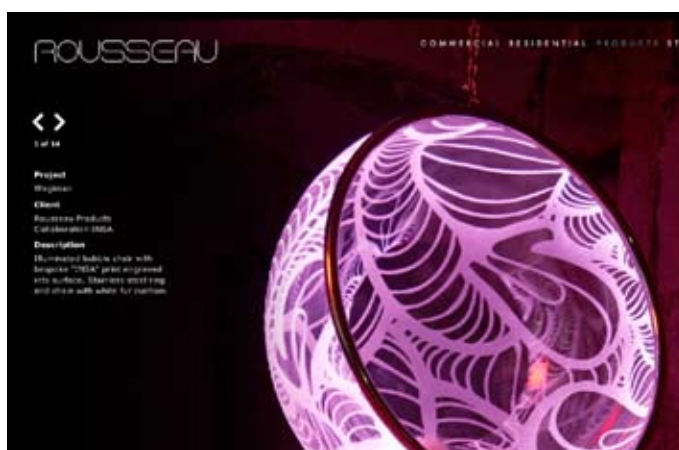
Rousseau Studio design bespoke interiors and unique products such the Wagiman bubble chair currently on show in London's Shoreditch House. Rousseau's clients include the Ice Hotel in Sweden and infamous London bar, Sketch.