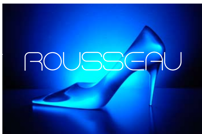
Rousseau identity, application and website Studio Rousseau