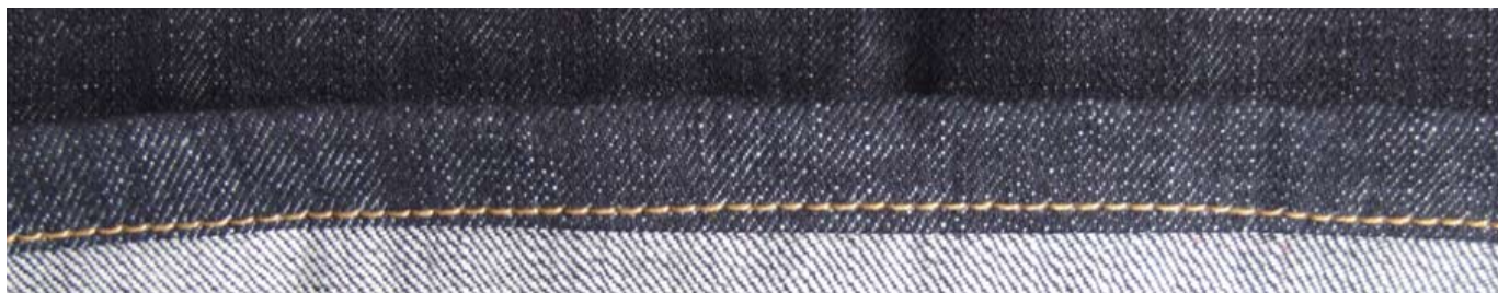
SABA Denim branding and application Apparel Group Australia