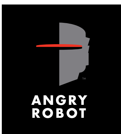
Angry Robot brand identity and marketing tools HarperCollins UK

This is the Spring London newsletter. We call it Chicken Vision because, well, we can. Since our relocation to Melbourne we've been working on branding for a new publishing imprint, marketing for a major shopping centre, packaging for the fashion industry and an identity for an interiors designer.