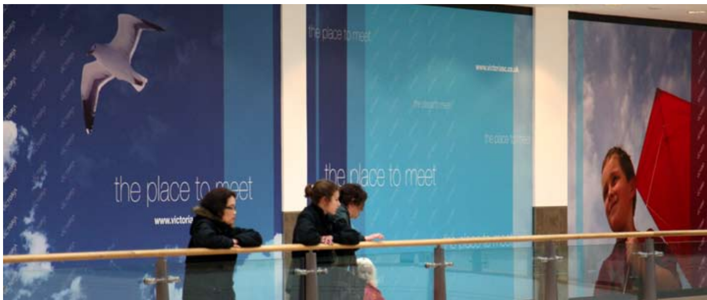
The Victoria Marketing Jones Lang LaSalle